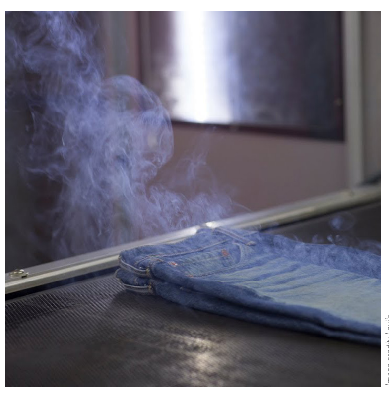
Levi Strauss & Co has invested in improving the environmental impact of garment manufacturing. A collaboration with Project F.L.X. (future-led execution) will change the finishing process of denim from hand detailing to automated laser in order to reduce chemical use.

A growing number of brands and manufacturers are taking the initiative to change methods of processing fabric and garments in order to decrease pollution. To support these efforts, governments (namely China), are tightening regulations in manufacturing regions to curb the current pollution levels. The challenge is to clean up existing pollution while maintaining manufacturing outputs and developing less polluting processes. Here are some examples of innovative processes that can be used in fabric and garment manufacturing: