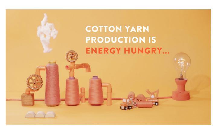
'Redress Design Award - The impacts of our fibres' video

WithWendy x Thread International | youtu.be/lwcGhLU3Zy4?t=1m41s