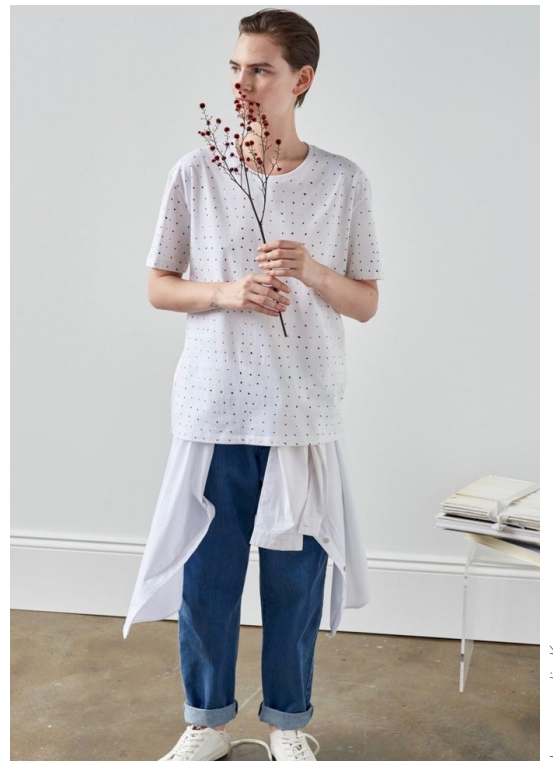
To ensure that fabric meets environmental regulations, designers can turn to certified fabrics, where independent third party testing is required. One example of this is the Global Organic Textile Standard (GOTS) which considers water and chemical usage throughout production stages. <sup>29</sup> Sustainable womenswear brand, Kowtow, is built on certifications and uses GOTS approved dyes and inks in fabrics and prints.