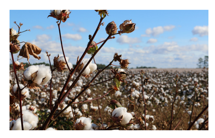
PLANT-BASED (Also known as cellulose-based) These are fibres that are harvested from plants. Examples of plant-based fibres are cotton, linen, hemp and jute.