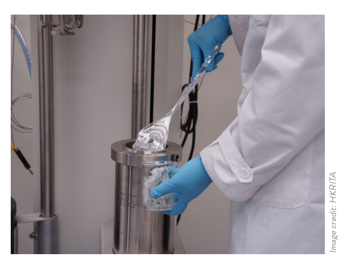
The Hong Kong Research Institute of Textile and Apparel (HKRITA) is working on a four-year innovative Closed-Loop Apparel Recycling Eco-System Program which has developed ground-breaking solutions to separate and recycle blended textiles into new fabrics and yarns - without any quality loss - through a hydrothermal (chemical) process. There are plans for this technology to be made available to the global textile industry - just consider the potential financial value of shifting the entire fashion system!