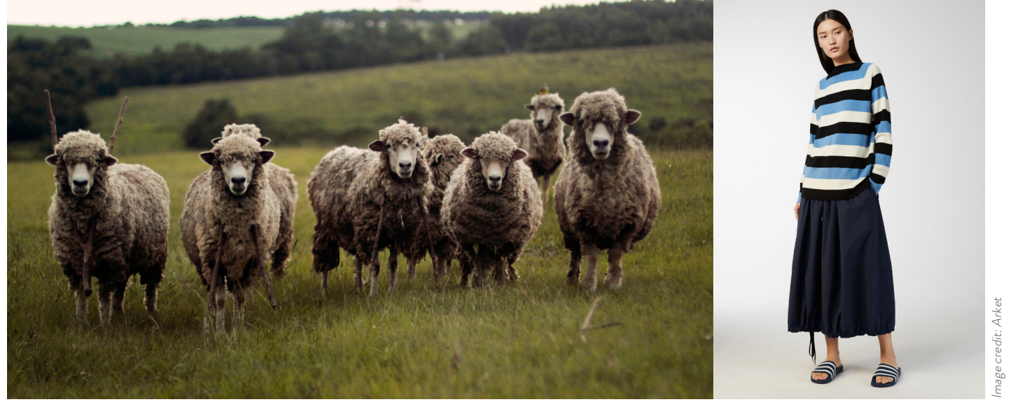
Organic wool is an alternative to the standard practice of wool farming which uses chemicals on sheep and wool during farming and/or fibre processing. To achieve certification as organic wool, the product must meet the criteria of individual certifying bodies, such as the Global Organic Textile Standard (GOTS). Arket, an H&M owned brand, uses organic wool in their knitwear collections.