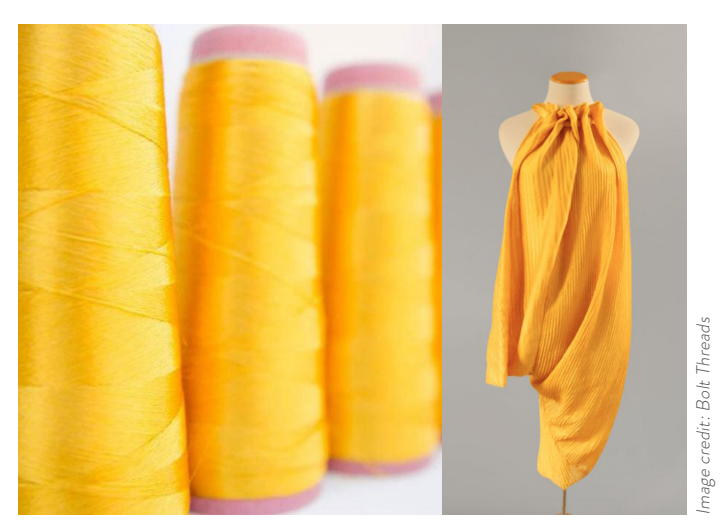
Bolt Threads, a US-based company, uses bioengineering to create Microsilk™, a protein fibre that is produced through the fermentation of genetically modified yeast, water and sugar. The fibre has the same molecular structure as spider silk with a tensile strength that is comparable to that of steel. The company partnered with Stella McCartney, who have used it as an ethical alternative to silk.

There are many improvements taking place in conventional fibre production to reduce the environmental impacts. Additionally there is an increased recognition of the value of 'waste' from the textile and other industries for use as raw material, plus all sorts of cutting edge fibres made from new sources, such as food waste which can biodegrade at the end of their life - another example of circularity. Trade shows are a great starting place to explore the best fibre options for your designs. Try The Sustainable Angle, which showcases innovative alternatives to conventional fibres, of which there are a growing number on the market.