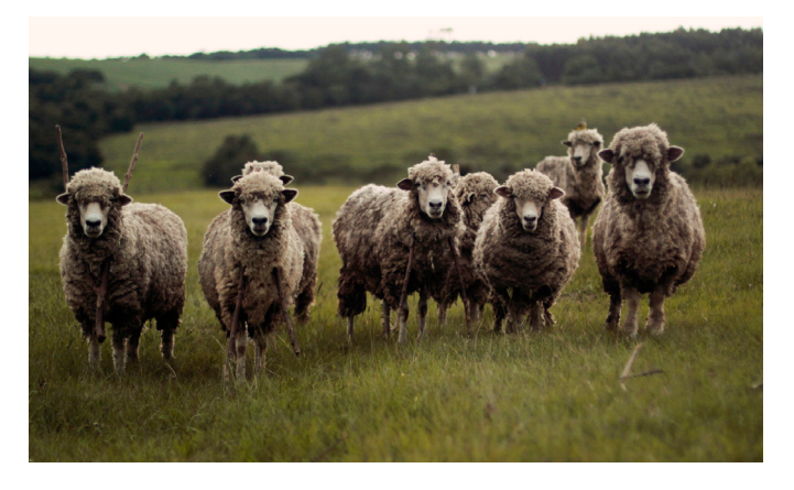
ANIMAL-BASED (Also known as protein-based) These are fibres that come from animal coats, or products produced by animals. Examples of these include wool, silk and down.