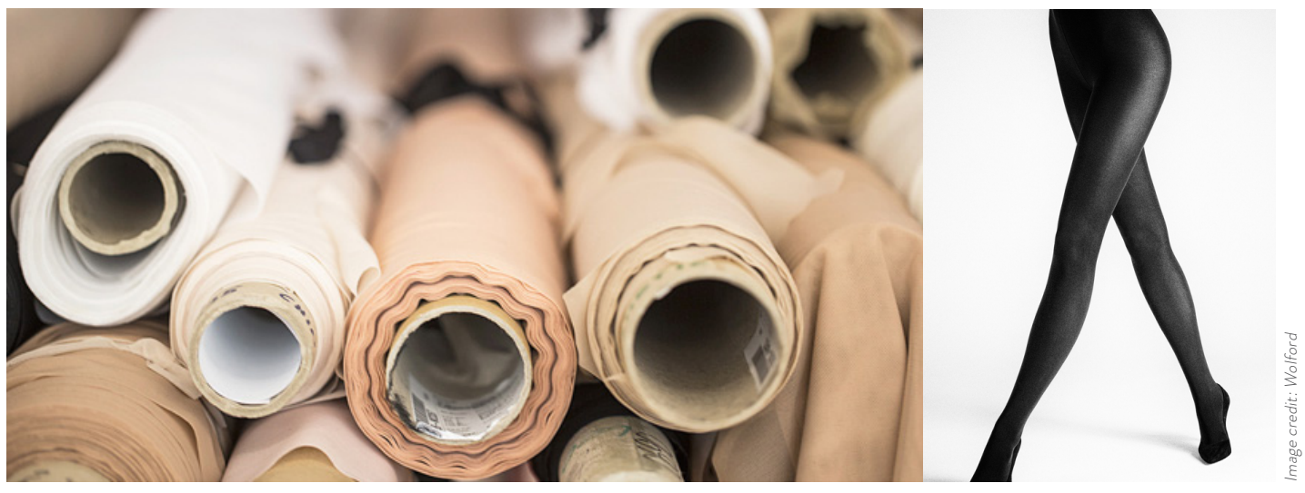
ROICA™ V550 is a sustainable alternative to conventional elastane yarn and is made with less water, scouring agent, energy and oil content.<sup>25</sup> Austrian lingerie brand Wolford is developing a line of lingerie using ROICA™ V550 elastic which decomposes without releasing harmful substances at the end of use. <sup>26</sup>

The apparel industry alone represents 6.7% of global greenhouse gas (GHG) emissions (equivalent to about 3.3 billion metric tons of CO<sub>2</sub>-eq), 28% of which is produced by the spinning of yarn from filament and staple fibre. There are a growing number of alternative yarn options that have been created with consideration for the environmental impact at the forefront. 24